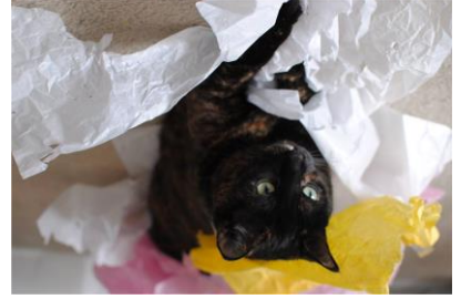
Tissue paper is the bomb dot com. Morchella loves to attack, shred, nest, and nap in this sublime substance. Morchella rates tissue paper 100/10.