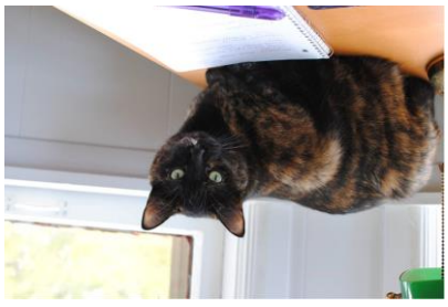
Morchella helps me work on my comprehensive exams. She rates grad school 9/10, because of all the extra time she got to spend on my lap while I was reading, writing, and editing. I dedicate all my educational achievements to her for her unwavering emotional support.