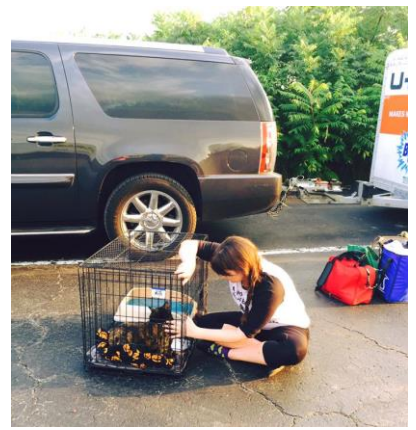
Morchella and I on the move from WI to DC. She is not a fan of travel. She rates travel 0/10.