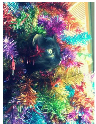
Morchella rates holiday trees 9/10. Here she is enjoying some holiday bird watching from her spot at the top of a 7 foot tree. Few ornaments survived.