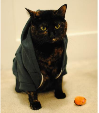
Morchella rates hoodies 0/10 for obvious reasons. #MissyChelliott IG/Tweet @queeriodicals